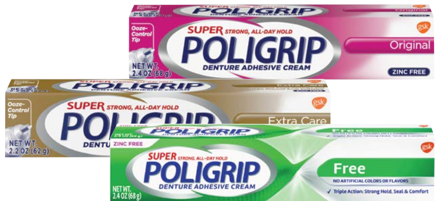
Super Poligrip Denture Adhesive Cream 2.2 to 2.4 ounce Original, Extra Care or Free.