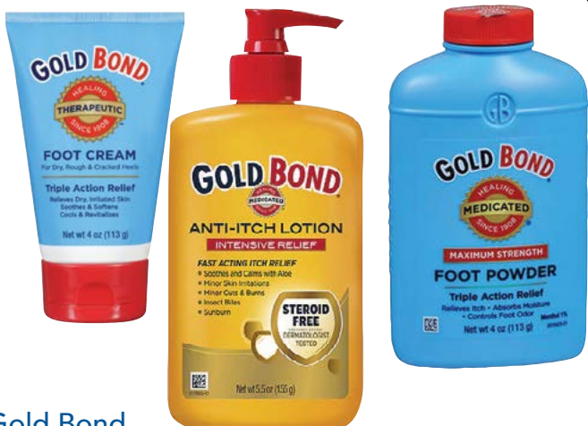
Gold Bond 1 to 4 ounce Assorted creams, lotion or powder.