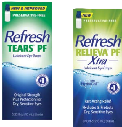
Refresh Lubricant Eye Drops .33 ounce Tears PF or Relieva PF Xtra.