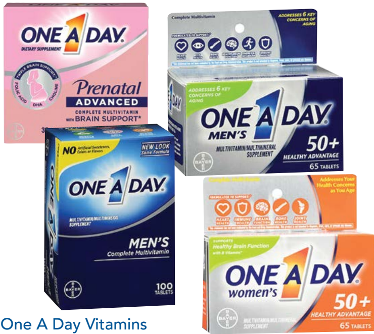
One A Day Vitamins 50 to 100 count Tablets. Assorted formulas for women or men.