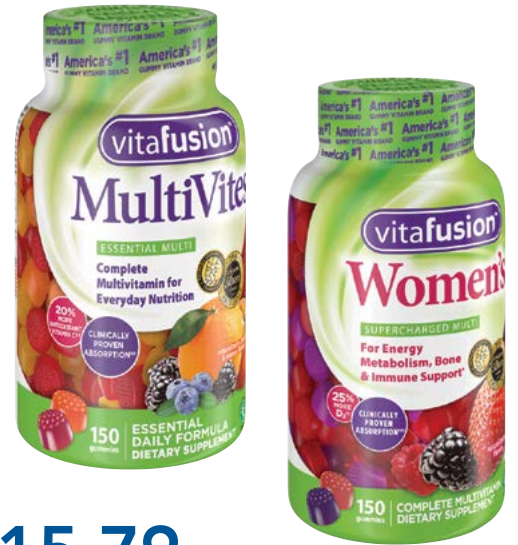
vitafusion 150 count MultiVites or Women's gummies.