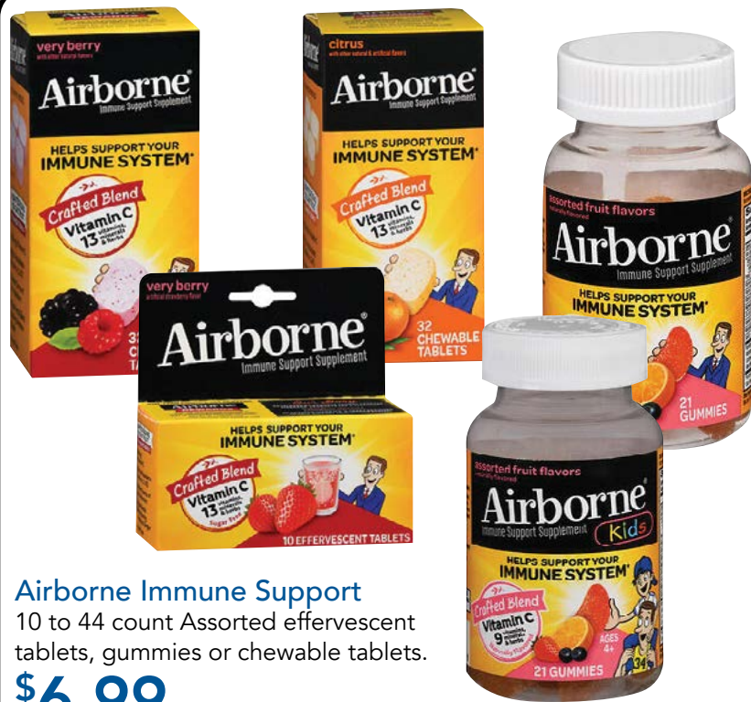
Airborne Immune Support 10 to 44 count Assorted effervescent tablets, gummies or chewable tablets.